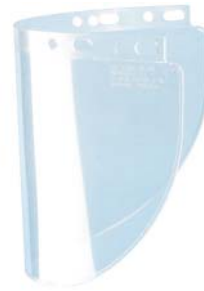
Fibre-Metal 4178 Wide Vision Faceshield Window IBT # 37400700 Clear

Deep crown protector and wider windows extend face protection. Deeper 4" crown protector extends protection without increasing weight. Incorporates wide-vision (17" x 8") wraparound windows and screens, which provide 40% more protective area than standard size faceshields. Fits easily over required spectacles or respirators. SEI certified to comply with current ANSI standards.