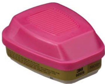
3M 60926 Multi-Contaminant/P100 Cartridges for Half or Full Mask Respirators