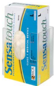
MCR Style 100 1 Slot Display Case (gloves not included) IBT #54801095