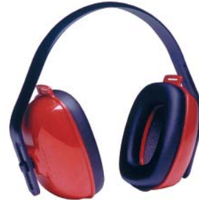
Howard Leight QM24+® Earmuffs IBT # 43905190 Red

The dielectric QM24+ is an ultra-lightweight, three-position earmuff designed for extended wear at a valued price. Weighing only 6 oz., the QM24+ features an adjustable crown strap for a secure fit over-the-head, behind-the-head and below-the-chin. Soft foam cushions are easy to clean with soap and water and can be replaced for extended use.