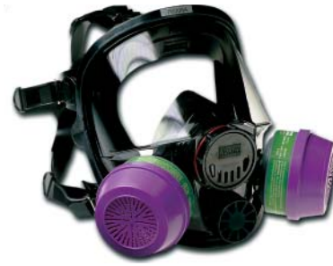
North 760008A Premium Full Mask Reusable Respirator (cartridges not included)