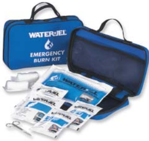
Swift 20P1600 Water-Jel® Burn Kit IBT #90253008340