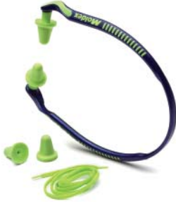
Moldex 6506 Jazz Band® Hearing Protector IBT #55100510

The new Jazz Band has been redesigned with increased protection and comfort in mind. The NRR was increased by designing the soft tapered foam pods to correspond to the shape of the ear canal. Jazz Band also features a more comfortable fit, achieved by decreasing the band pressure. The end result is greater user fit and comfort, which can increase compliance. Workers will want to wear it all day long.