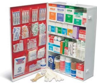
Swift 34400LF 4-Shelf First Aid Cabinet IBT #90253009930