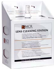
MCR LCS2 Lens Cleaning Station IBT #28200505

▲ Fits F400, F500, FH66, FM70 & F71 series