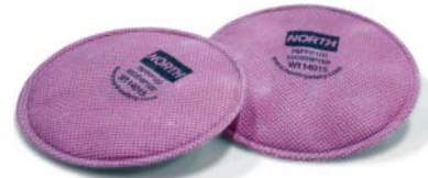
North 75FFP100 P100 Particulate Filters for Half or Full Mask Respirators