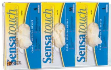
MCR Style 300 3 Slot Display Case (gloves not included) IBT #54801098