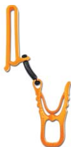
MCR UCDBO Utility Clip IBT #54800995 Orange

Great for applications in the utility industry, industrial workplace, food industry and various recreational activities. Clip will break-away if caught in machinery. Attach at multiple locations for comfort or convenience.