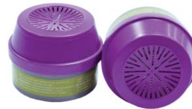
North 75SCP100 Multi-Contaminant/P100 Defender Cartridges for Half or Full Mask Respirators