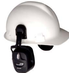
IBT #31305110 T3H Cap-Mount Earmuff