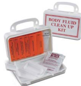
Swift 35P10BFK Blood Borne Pathogen Kit IBT #90253012190