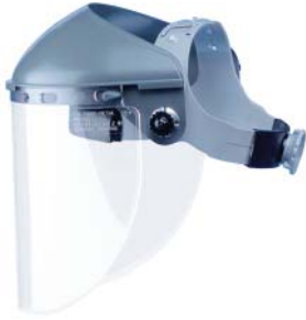
Fibre-Metal F-400 Faceshield IBT #37400670

Deep crown protector and wider windows extend face protection. Deeper 4" crown protector extends protection without increasing weight. Incorporates wide-vision (17" x 8") wraparound windows and screens, which provide 40% more protective area than standard size faceshields. Fits easily over required spectacles or respirators. SEI certified to comply with current ANSI standards.