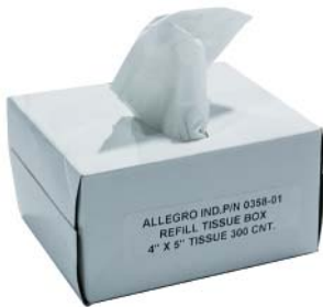
Allegro 0358-01 Lens Cleaning Tissues IBT #31302775

Uvex Clear lens cleaning products are specifically formulated for anti-fog and scratch-resistant hardcoats and do not contain silicone. 16 oz. spray bottle.