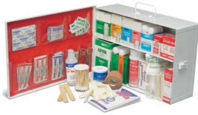
Swift 34140LF 2-Shelf First Aid Cabinet IBT #90253009500