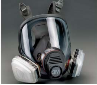
3M 6800 Economy Full Mask Reusable Respirator (cartridges not included)