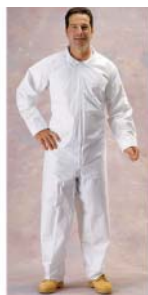
Lakeland TG412XL MicroMAX® Coverall IBT #50409260 XLarge - see other options below

This line of general purpose protective clothing can be used in any non-hazardous environment where dirt, grime, splashes and spills are present. MicroMAX fabric is comprised of a microporous film with a nylon scrim between the film and substrate that gives the material additional strength. Tough can-do protection at a price that is sure to agree with your budget.