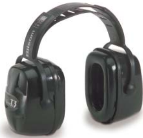
Bilsom Thunder® T3 and T3H Earmuffs IBT #43905200 T3 Earmuff

Thunder series earmuffs are designed with all-day comfort in mind. Thunder headband earmuffs feature a unique dual headband for better positioning and breathability and a non-deforming outer headband that minimizes pressure on the head. Plus, its dielectric construction withstands use and abuse while protecting workers in electrical environments.