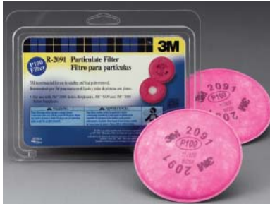
3M 2091 P100 Particulate Filters for Half or Full Mask Respirators