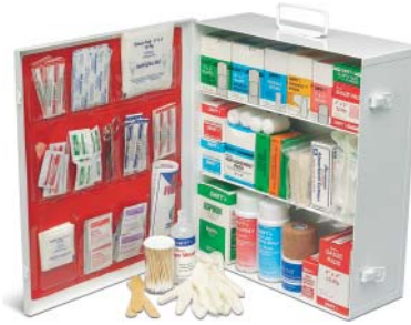
Swift 34180LF 3-Shelf First Aid Cabinet IBT #90253009680