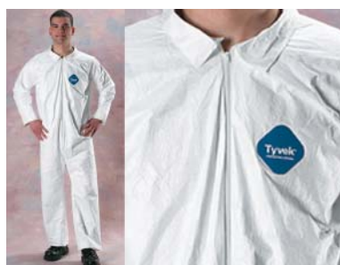
Lakeland 1412XXL Tyvek® Coverall IBT #50408880 2XLarge - see other options below

Tyvek Protective Wear™ meets or exceeds ANSI 101-1996 sizing requirements and are required to pass dynamic fit tests to minimize rips and tears. All Tyvek Protective Wear garments are clearly marked with a blue label to distinguish them from others which may have not been manufactured from Tyvek or under the entire quality system. It's your assurance of quality manufacturing that strengthens your safety combination.