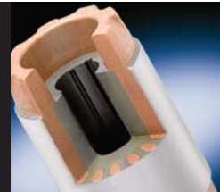
A unique die cast copper rotor design is one of the key elements that enable Siemens Ultra Efficient motors to exceed NEMA Premium® efficiency standards.